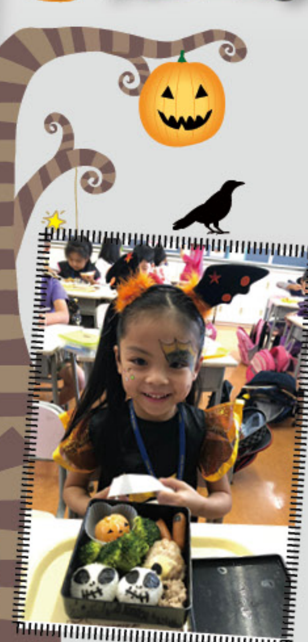
NETs and students in their Halloween costumes