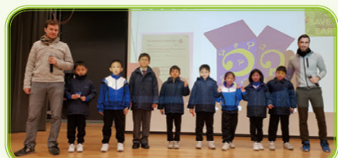
NETs with the winners from P.4-P.6