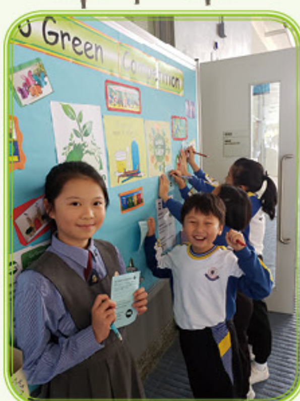
Students having fun and posing