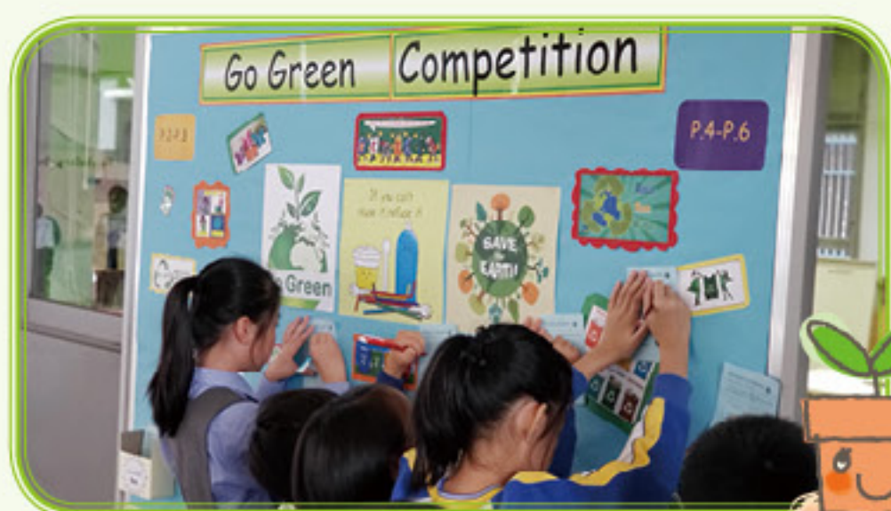
Students participating in the competition

This year the theme of our school is "A Better Life-Energy Saving and Waste Reduction". The NET Team organized a 'Go Green Competition' in support of this. Students were invited to look for posters around the school and answer some questions. A lot of students participated and won prizes.