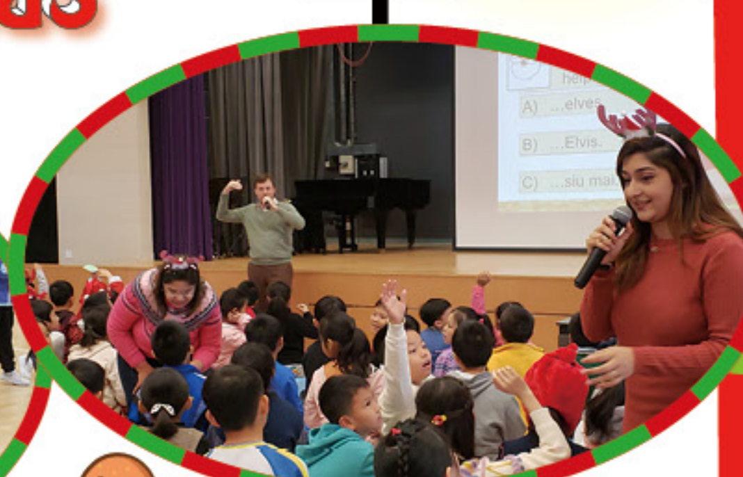
Elite Team students having fun at the Christmas party