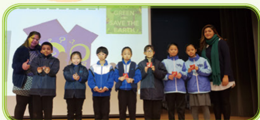
NETs with the winners from P.2-P.3